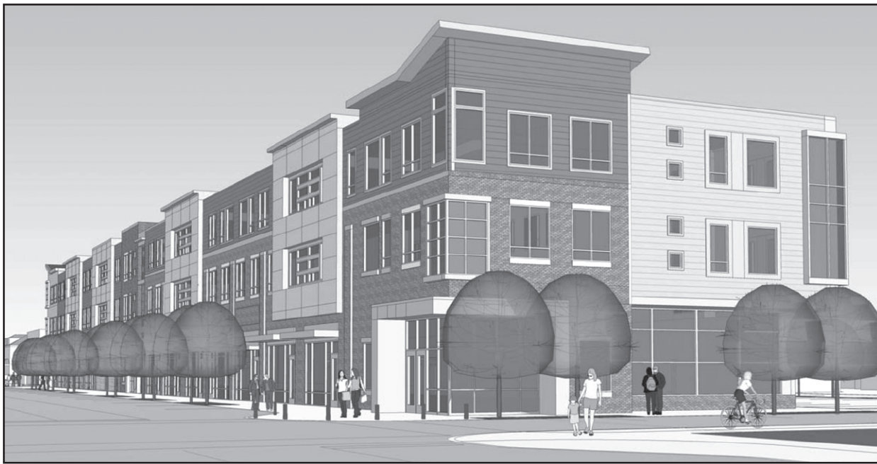
Artist's rendering of The Uptown at College Avenue from 49th to 50th streets.

The development team estimates The Uptown will generate a combined $5 million annual income for the city, state and federal governments from employment,