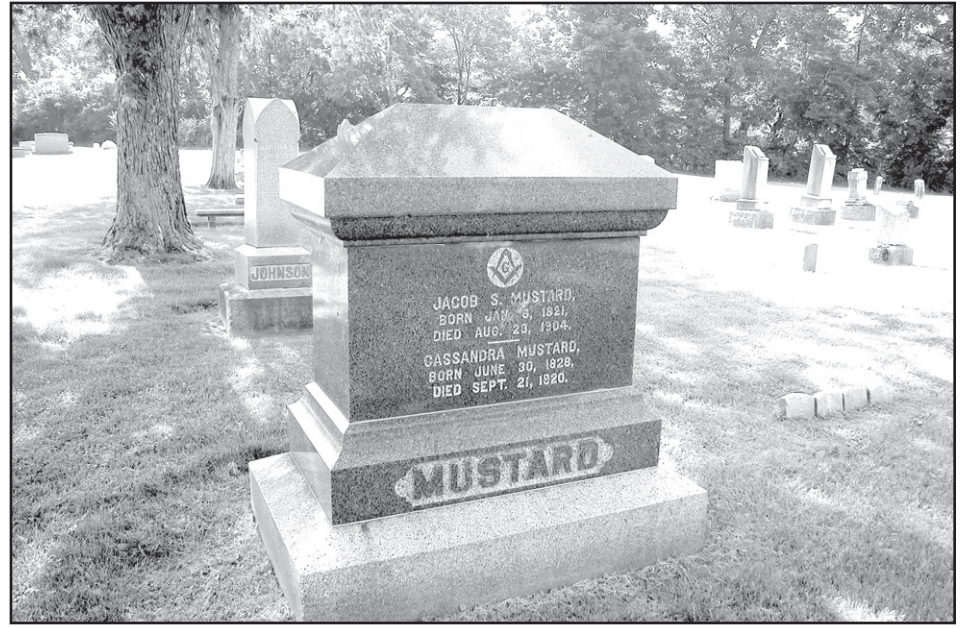
Gravestones of historic Broad Ripple figures can be found at Union Chapel Cemetery.

And to those of you currently trying to promote economic development in this