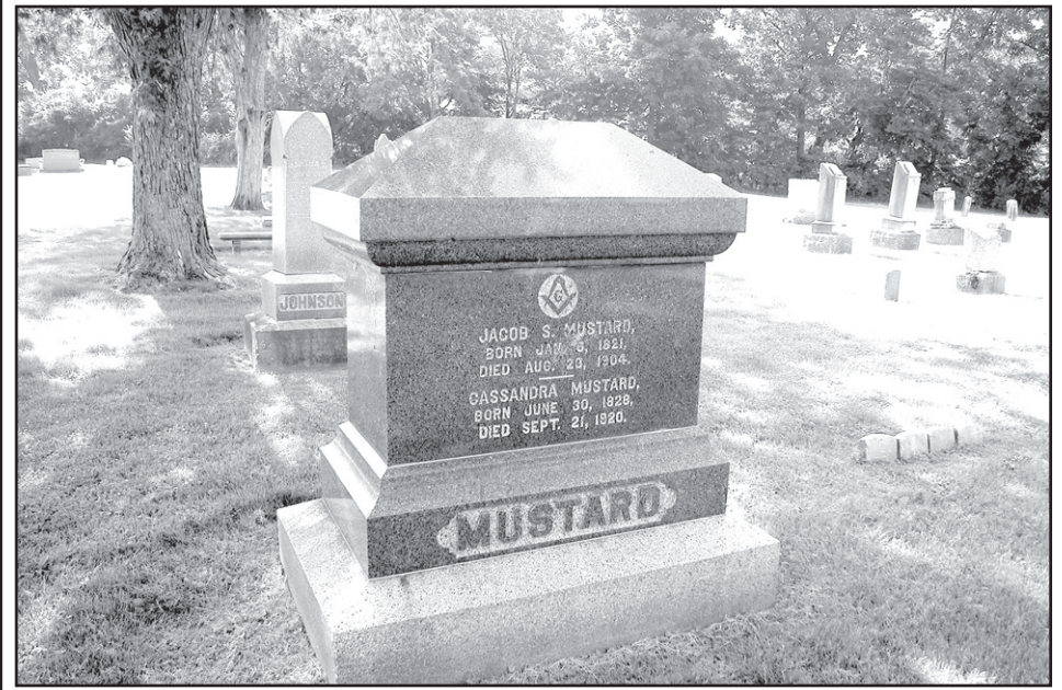
Gravestones of historic Broad Ripple figures can be found at Union Chapel Cemetery.

And to those of you currently trying to promote economic development in this